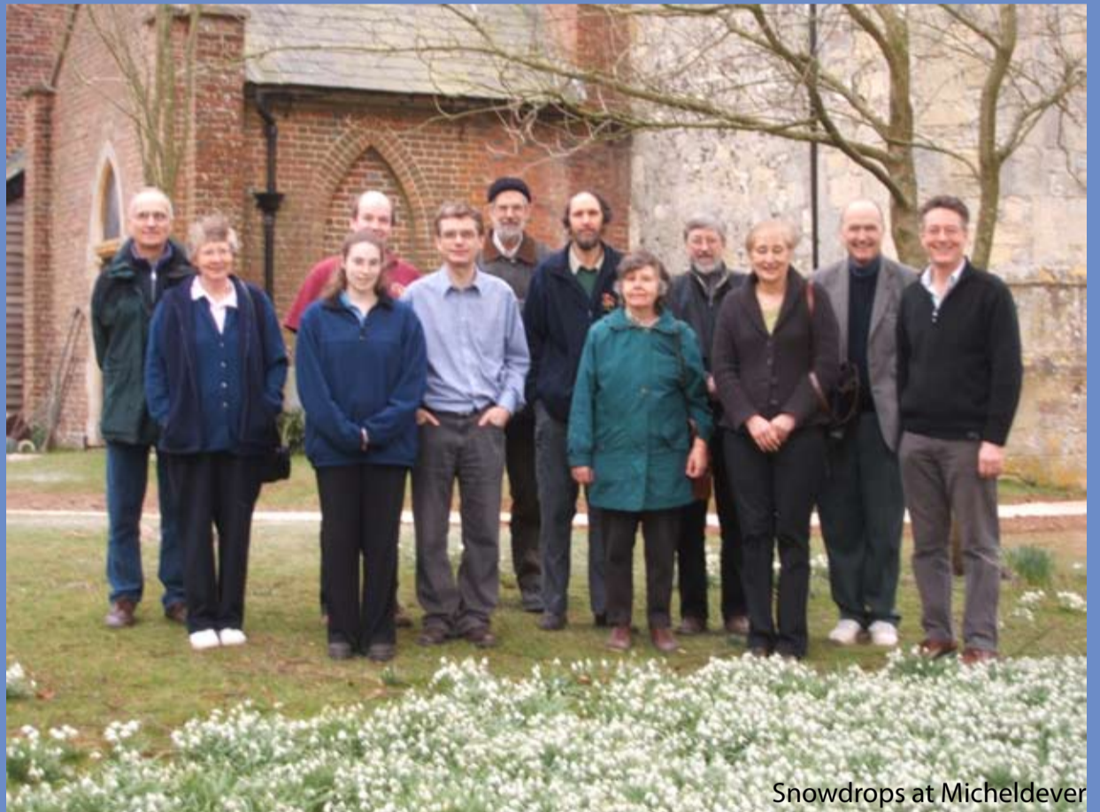
Snowdrops at Micheldever