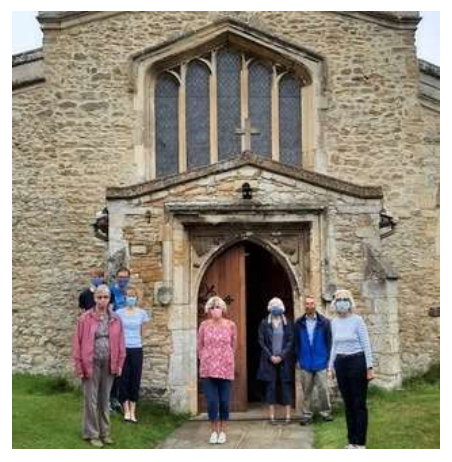
Long Crendon ringers on VJ day

partial return to church services and ringing, at least half of our towers are managing some sort of ringing, generally on alternate bells. Both Aylesbury and Long Crendon have managed to ring a few more bells, up to six – Aylesbury because they have both family groups and plenty of space and Long Crendon because they have the extra bells as well as family groups. All towers that are ringing carried out appropriate inspections before the return. Additionally, Long Crendon have taken the time to paint the grillage, bell frame, fixtures and fittings and hope to take delivery of their new ropes before Christmas.