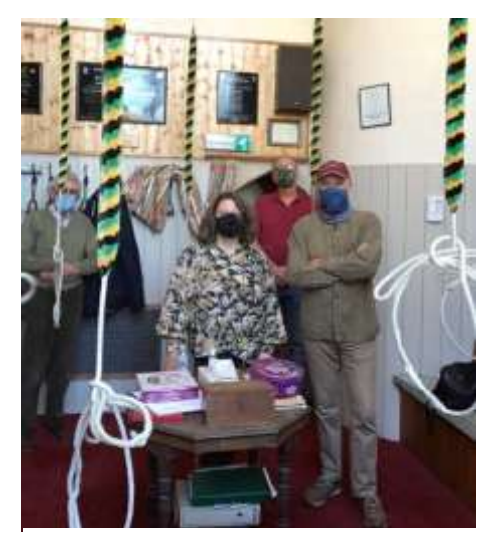
Hungerford's 'Covid-19' ringers

After a strangely quiet summer, things have stirred in the Newbury Branch with some towers finding ways to make themselves heard on Sunday mornings despite the ongoing virus crisis. Newbury has been ringing on a limited number of bells