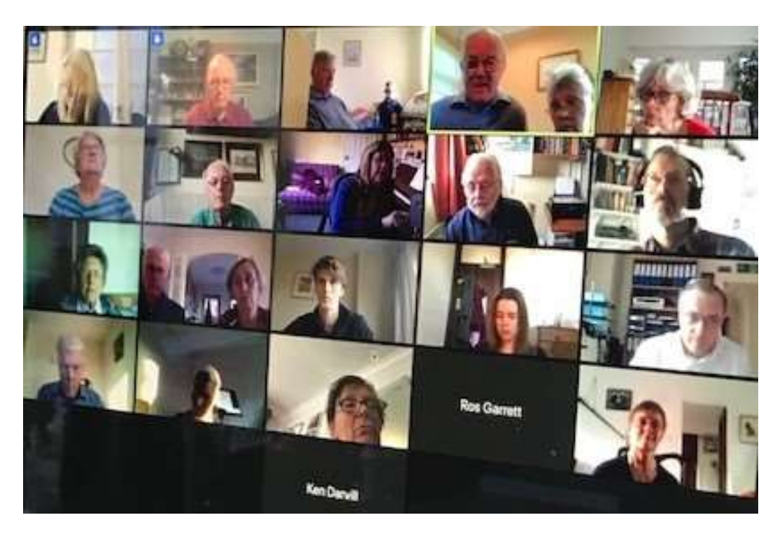
The EBSB AGM on Zoom