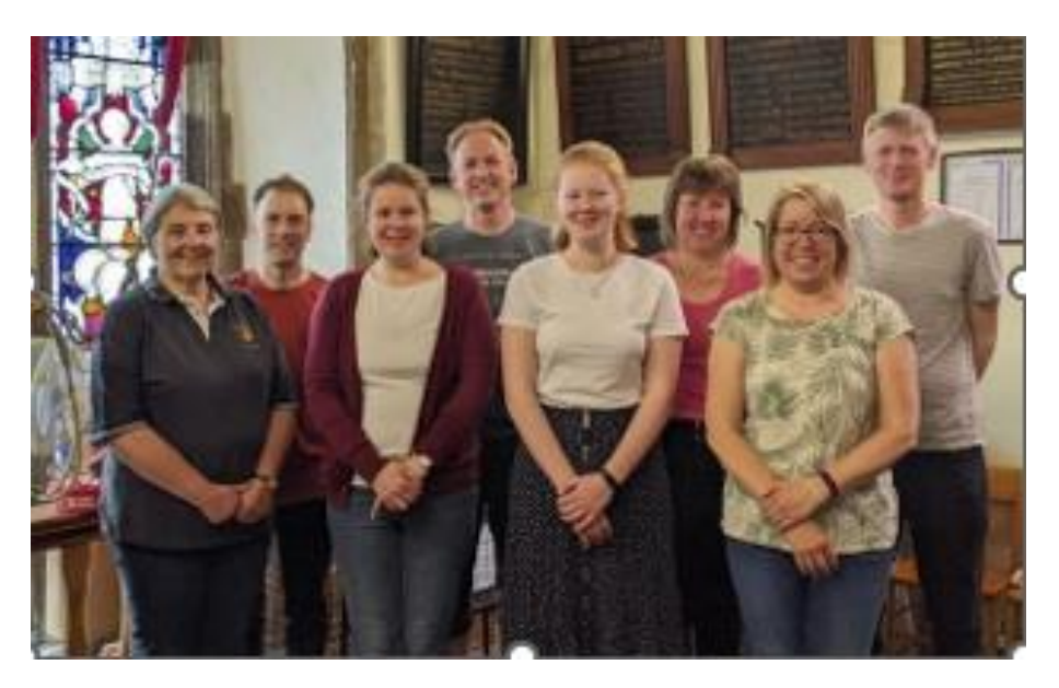
St. Giles-in-Reading band for Yorkshire quarter