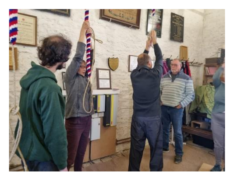
Teaching at the first Winter School 22-23 session

In summer 2022 we invited learners to come and consolidate their skills at a