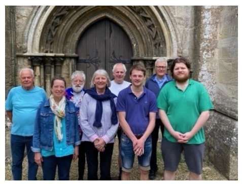
The Grandsire band at Shipton

A 'mini branch outing' within the branch ensured there was ringing in towers not often heard, with ringing from rounds and doubles to Plain Bob