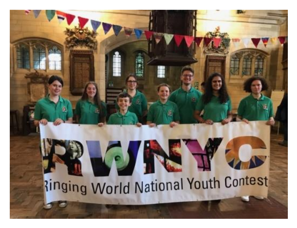
The Bucks & Berks Young Ringers at the Ringing World National Youth Contest