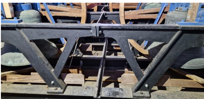
Alfred Bowell Frame of 1905