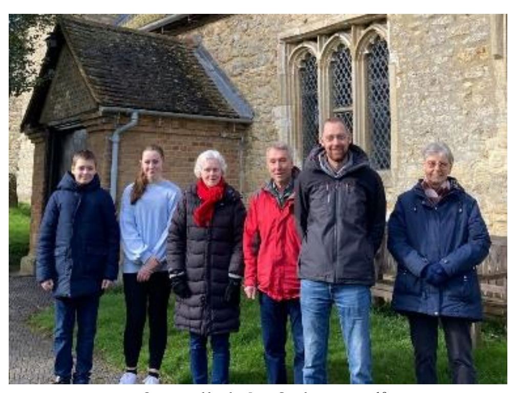
Quarter peal band at Long Crendon, see page 10