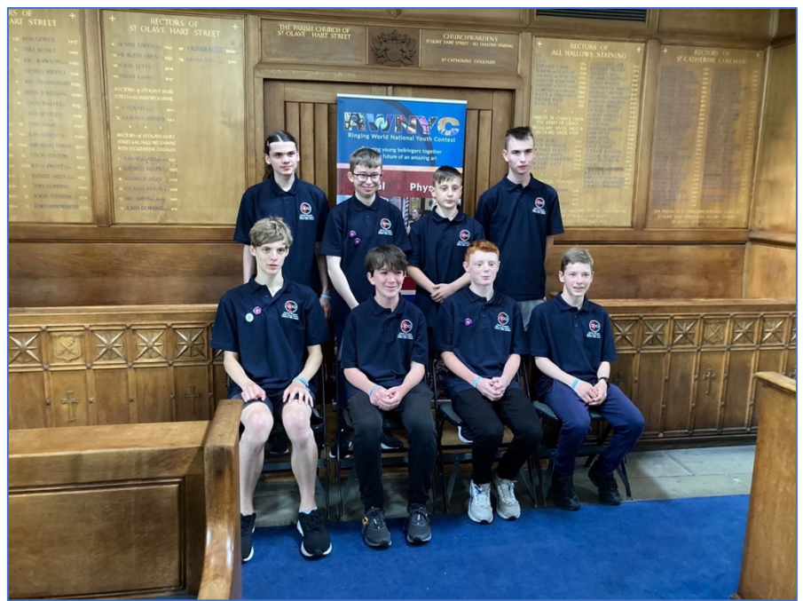
2024 ODG Young Ringers Band, see page 11

Newsletter of the Oxford Diocesan Guild of Church Bell Ringers website: odg.org.uk/