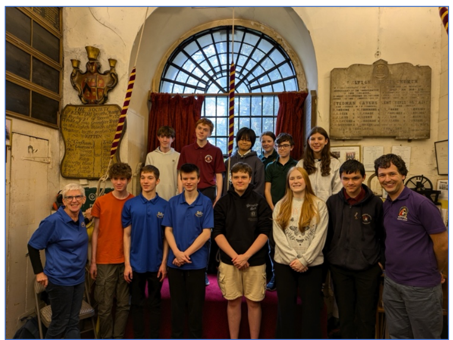
The young ringers at St Alfege, Greenwich

At the beginning of October, SDB, Reading, and Berks & Bucks Young Ringers joined up for a mini tower outing. We walked from Shottesbrooke to Waltham St Laurence and back, ringing at both churches. Ringing ranged from plain hunt to Norwich Surprise Minor. It was a lovely afternoon, and the rain thankfully held off! More recently the youth bands of Berks & Bucks, Middlesex and Surrey met for a tour in London. They rang at four towers along the Docklands Light Railway including The Isle of Dogs (Cubitt Town), the location of the first ever all Ladies Peal in 1912. 8 female ringers rang some rounds in celebration of this first achievement reflecting on how things have changed over a century.