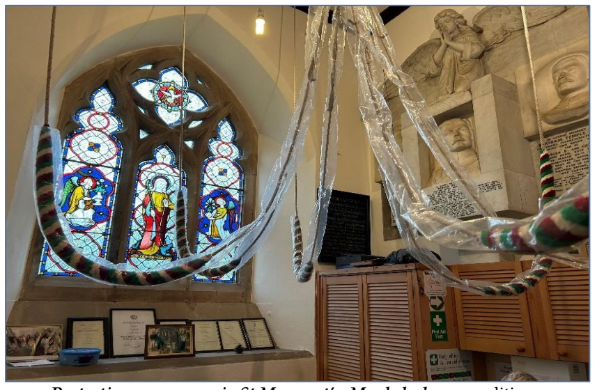
Protective rope covers in St Margaret's, Mapledurham conditions. Our solution was to purchase some 100 mm medium duty lay flat polythene tubing. That fits closely but not tightly over the sally. Cut into 3-metre lengths to cover the sally and hemp rope tail below it and thus provide an impervious layer around the rope and sally ( see picture on left with covers installed ). We install the covers only when we anticipate high humidity

Like many we have polyester rope above the sally which is resistant to the problem, and we needed to prevent dampness getting into the rope and sally.