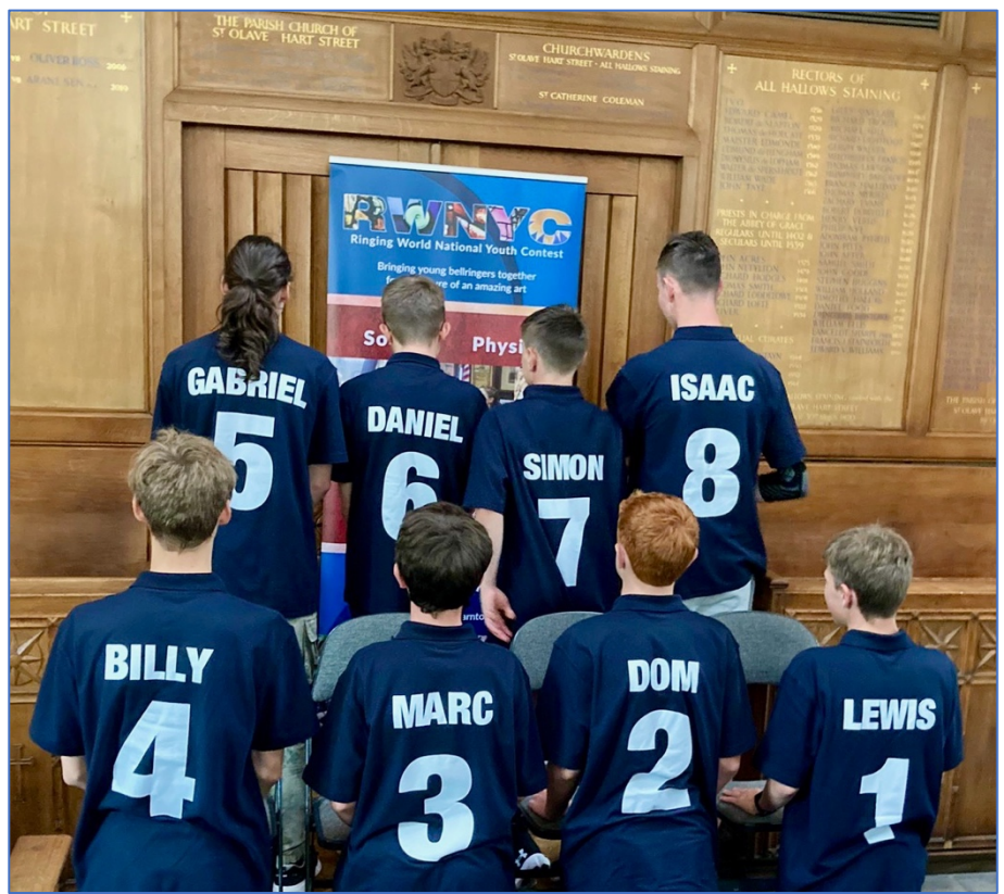
Young Ringers Band Shirts, see page 11