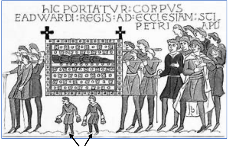
Bellringers in the Bayeux Tapestry

However, in every organisation, the management of change is always emotive. Often, I read back through the Guild Reports from 1851 and see how much has changed in the intervening years and I am frequently shocked by the intimidating language, the oppressive conventions of previous generations and the controversies that resulted when change took place. And yet, the ODG has grown, survived, flourished and become one of the most respected of the territorial ringing associations. Let us not forget that when we strive to develop future strategies; we must be progressive and optimistic, allow for constructive discussion, be aware that decisions should be made with the future of ringing as a priority, and avoid our own comfort zone of the past if it is no longer appropriate for the generation of the future. A lighter aside - The illustration below is from the Bayeux Tapestry which was embroidered about 1100 and is on my To-Do list so if anyone would like to come with me...?